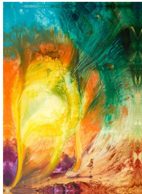
A Journey into the Light